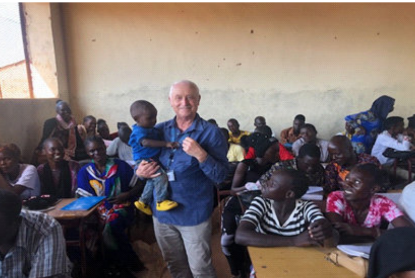
Middle: One young participant whose mother is an ASEP student