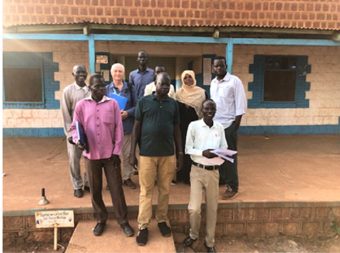
Top: Wau first cohort with AES staff